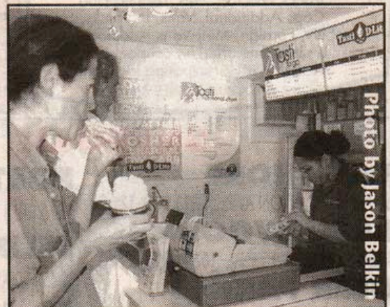
Customers enjoy Tasti D-Lite soft serve dessert on opening day at Hamptons Coffee Company, Water Mill, site of the two company's first joint venture.